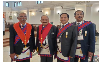
Sense of achievement writ on the organisers' faces

It is but fitting that we place on record our deep appreciation for the zealous labours of those Brethren who, with diligence, foresight, and devotion to duty, have been the chief architects of this successful event. Their untiring efforts in planning, organising, and executing every detail with precision have ensured the smooth and dignified manner in which our proceedings have been conducted. Truly, they have exemplified the finest traditions of our Craft — harmony, brotherly love, and the noble spirit of service.