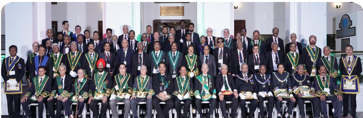
Group photograph at Freemasons' Hall, Egmore, Chennai.

Thus did the Brethren of Lodge Madras distinguish themselves as worthy hosts—upholding the dignity of the Craft while embracing the joy of service. What they organised was not merely a meeting of men, but a festival of the spirit; not merely a hosting of proceedings, but a consecration of affection. It is but fitting that we place on record our deep appreciation for the zealous labours of those Brethren who, with diligence, foresight, and devotion to duty, have been the chief architects of this successful event.