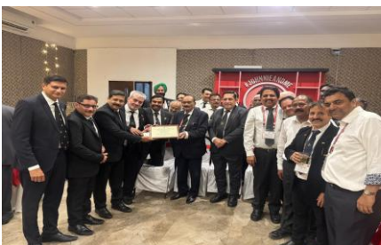
Lodge Cataract honours Lodge Madras

The Rededication Ceremony, conducted with dignity and splendour by the District Grand Lodge of India, stood as the crowning jewel of the celebration. The Rededication at the Centenary of a Lodge is more than a ceremony: it is a moment of collective awakening, binding past, present, and future with the mortar of brotherly love, and sealing in every heart the eternal vow that Masonry shall endure.