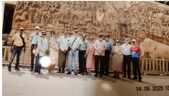
Touring Brethren and ladies at Mahabalipuram

A day after the event, some of the brethren proceeded on a group tour of Mahabalipuram, Pondicherry and Auroville along with their spouses for a brief holiday of three days Touring before returning to their hometowns. While there, a few chose to attend a meditation session at the famous venue, while others undertook other sightseeing sojourns before returning home via different modes of transport as per their convenience. All in all, it was a pleasant experience for all.