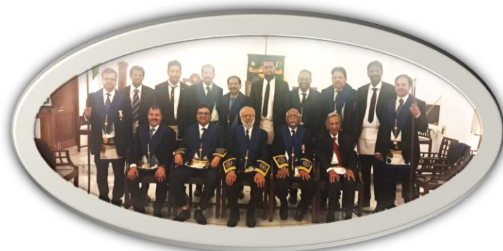
Group photograph on the occasion of Lodge Madras No. 1342 S.C. at its regular meeting on 15 th July 2025 when 2 new candidates were initiated and another Bro. re-admitted as a re-joining member.