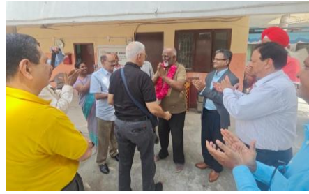
Recognition of the management of "Little Drops"

Our recent charity drive at this blessed institution was more than an act of giving; it was an experience of the heart. Where volunteers, friends, and well-wishers came together, each carrying a humble offering — some with essentials, some with funds, and others simply with the warmth of their presence. Together, these “little drops” merged into a river of kindness, flowing gently into the lives of those who need it most.