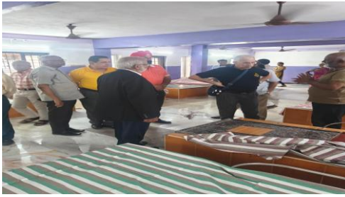
The interiors of "Little Drops"