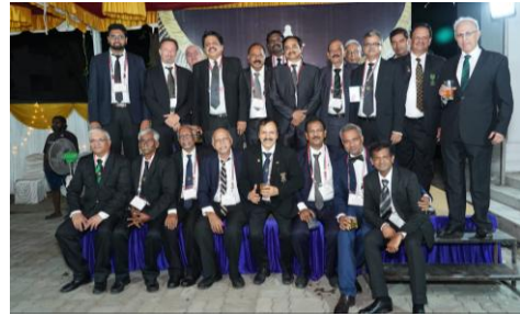
Cheerful Brethren of Lodge Madras

The Centenary celebrations and Rededication ceremony of Lodge Madras No. 1342 S.C. on Saturday, 13 th September 2025, was more than a celebration of years; it was a reaffirmation of purpose, a renewal of vows, and a demonstration of the unbroken chain of Masonic light. The Daughter shone resplendent before her Parent District, not in pride but in humility, not in splendour alone but in service.