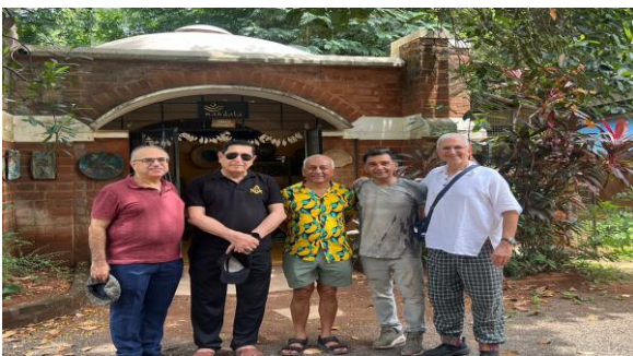
Outside Mangala Potteries, Pondicherry

For in the ledger of Masonry, the worth of a Lodge is not measured in numbers or years, but in the sincerity with which it honours its obligations. By this measure, Lodge Madras shone resplendent—an ornament to her District, a jewel to her Constitution, and a true Daughter of our eternal Brotherhood.