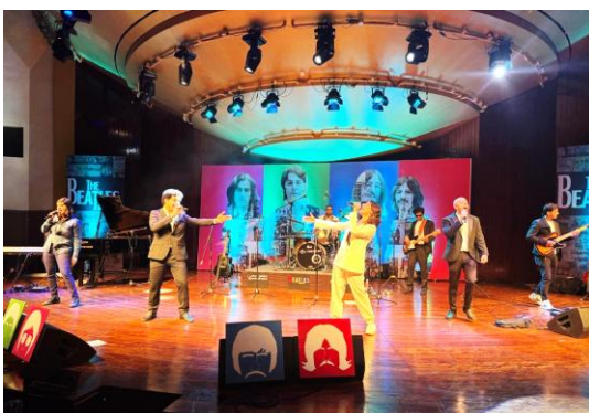
An exhilarating 'tribute to the Beatles' underway

From the very first chords of “ Come Together ”, the atmosphere was electric. The stage glowed under soft lights as the performers—channeling the then-admired Fab Four’s infectious energy—whisked the audience away on a journey through the swinging sixties. The audience found themselves clapping, tapping, and often singing along to vocal melodies that have defined generations.