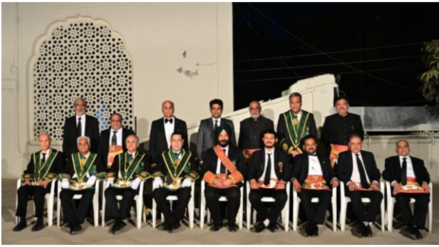
Group Photograph at the main Foyer of the Temple.