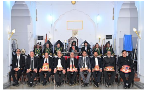
Group photograph in the Temple after the meeting .

The Goshamahal Baradari is probably the only well preserved palace built by the Qutb Shahi rulers, as almost all their palaces were destroyed during the long siege of the kingdom by Aurangzeb. It is a central historic landmark — a Qutb Shahi era palace built in the late 17th century (1680s) by Sultan Abul Hasan Tana Shah. It's one of the few surviving palaces from that dynasty in Hyderabad.