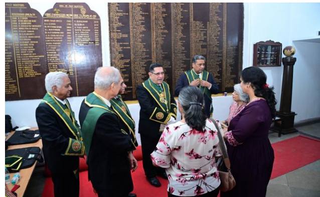
Explaining the finer nuances of Freemasonry to the ladies

Adding to the splendour of the evening was the presence of Ladies and non-masons, who were afforded a rare and meaningful glimpse into the beauty, symbolism, and timeless values of Freemasonry, thereby enhancing the spirit of universality, goodwill, and brotherly love that so fittingly characterises Lodge Universal Peace. The occasion reflected the enduring strength, harmony, and continuity of the Lodge, standing as a testament to a hundred years of dedicated service to the Craft.