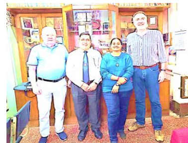
Clockwise from Top Left: 1. Visiting Dignitaries. 2. With the Dist. Gr. Secretary. 3. At the District Office. 4. Welcome at the Airport.

The visit served as a significant milestone in strengthening the fraternal bonds between the District and the Grand Lodge. A core component of this visit was an exhaustive review of the District's administrative protocols and financial records. It is with great pleasure that we report that the visiting dignitaries expressed complete satisfaction, finding no anomalies in our operations whatsoever. The visiting dignitaries arrived for a week-long series of engagements, and the interactions permeated an aura of mutual trust and confidence during the course of a scheduled review of the District's governance framework and fiscal health.