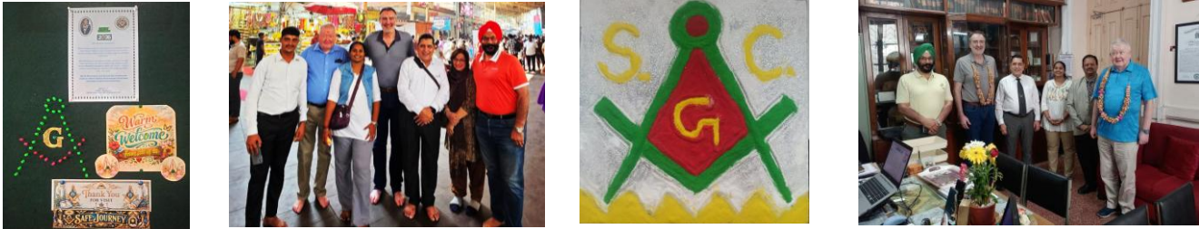
1. Welcoming display at the District Notice Board. 2. At a darshan of Siddhivinayak. 3. Rangoli welcome. 4. With our Brethren and Office staff.

In the interest of maintaining the highest standards of Masonic regularity and transparency, the GLS delegation conducted a thorough inspection of the Governance Records and Minute Books, Financial Stewardship and Accounts, meticulous nature of the documentation and the adherence to the Constitution and Laws of the Grand Lodge of Scotland.