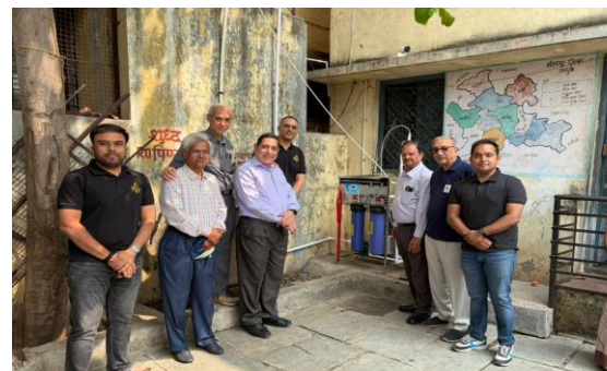
Adherence to the noble cause of charity and benevolence

The lit-up faces of the individuals receiving this act of benevolence bore testimony to their genuine need for potable drinking water.